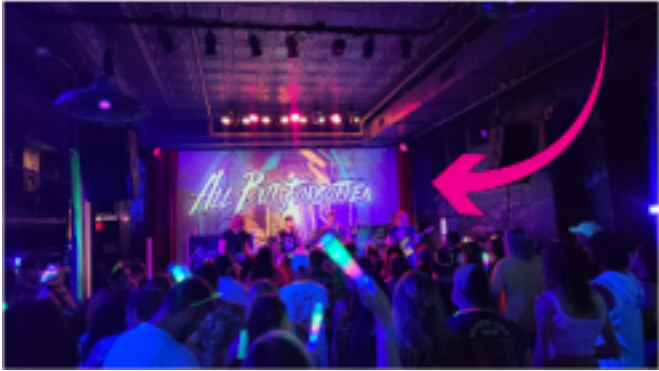
Projection Loops Between Sets