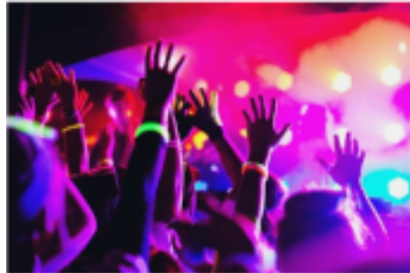
Lighting Production Presenting Sponsorship