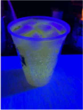
Glo-Cocktails Presenting Sponsorship