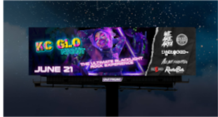
Branding on advertising & promotional materials